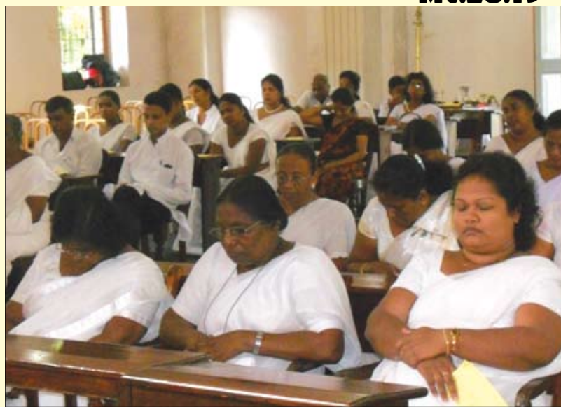
The new animators of the Joseph Vaz Deva Dharma Nikethanaya

In keeping with the Year of the Word of God, which began last November, in the Archdiocese of Colombo and promulgated by the Archbishop of Colombo, His Eminence Malcolm Cardinal Ranjith, thirty-six students of the Joseph Vaz Deva Dharma Nikethanaya, Borella, who had completed their final year in theological studies, have been sent out as animators to teach the Word of God at school and parish level.