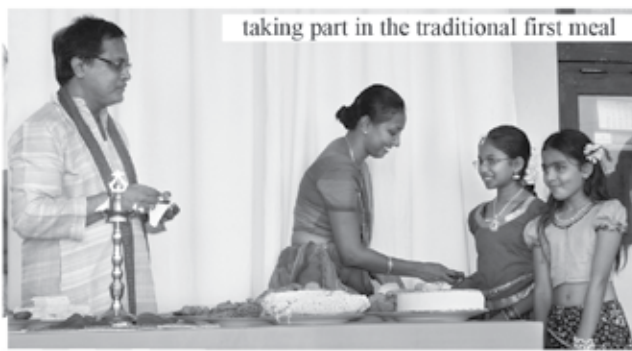
taking part in the traditional first meal