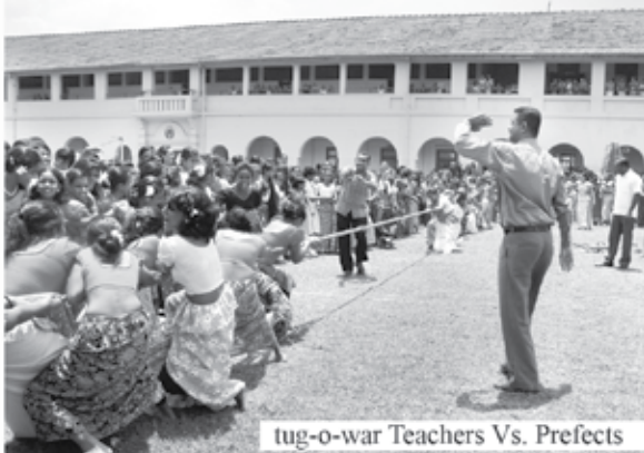
tug-o-war Teachers Vs. Prefects