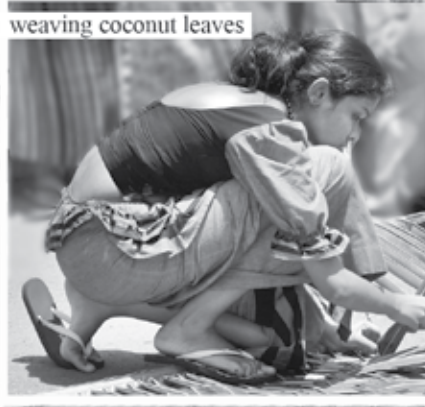
weaving coconut leaves