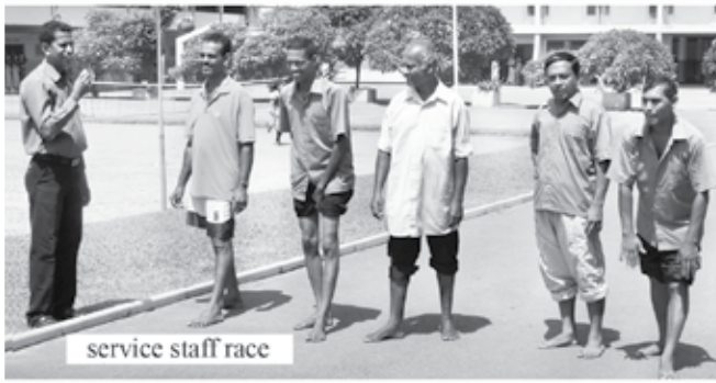
service staff race