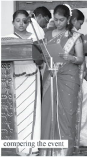
compering the event