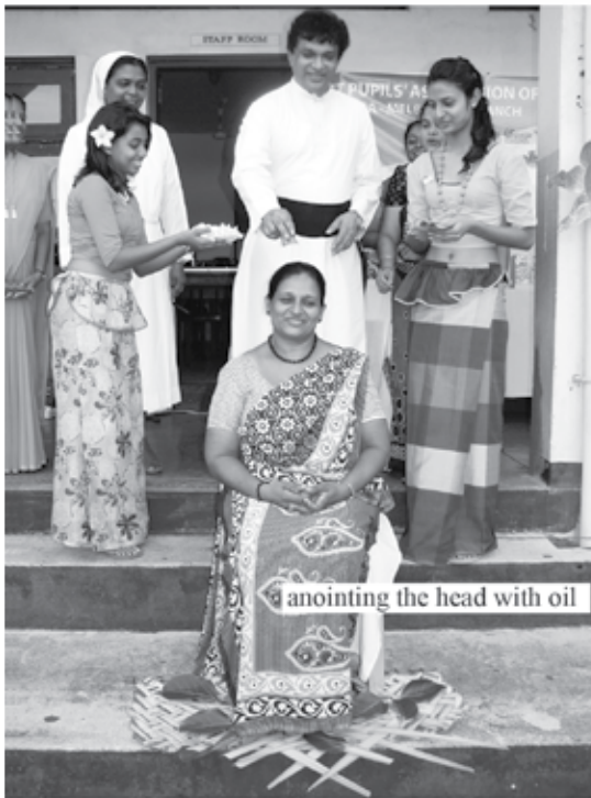
anointing the head with oil