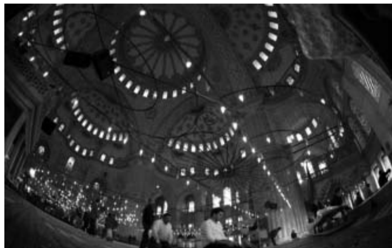
People pray in the Blue Mosque in Istanbul

Pope Francis' scheduled visit to the mosque is important because the Pope will learn from mixing with those worshipping inside that "Islam is always peace," Kiz-