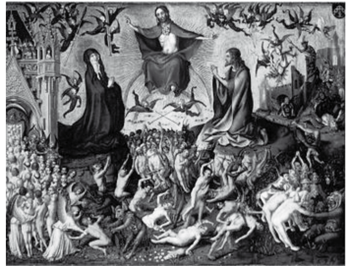
The 'Last Judgment' by Michelangelo

"It is time to take stock and see whether we have actually grown in our Marian piety"