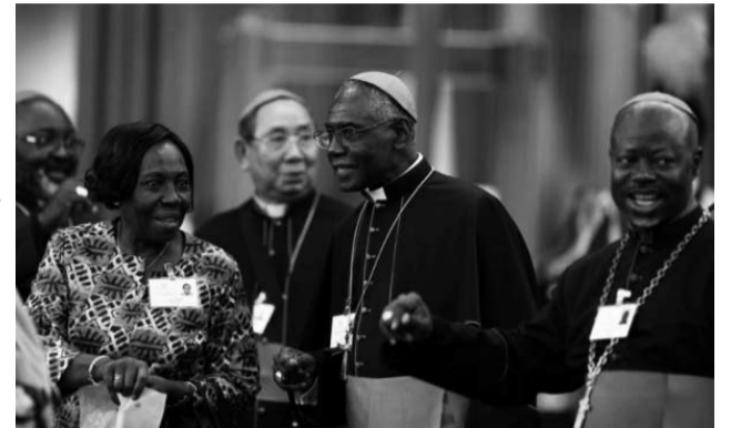
Cardinal Sarah, from Guinea, is described as 'traditional' in terms of liturgy

Pope Francis has named Cardinal Robert Sarah as the new prefect of the Congregation for Divine Worship and the Discipline of the Sacraments.