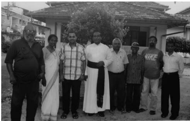
The Writers' Association of the Chilaw Diocese gathered at Holy Family Convent, Wennappuwa to discuss the launching of a new newspaper, under