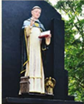
Saint Thomas Aquinas (1225-1274)