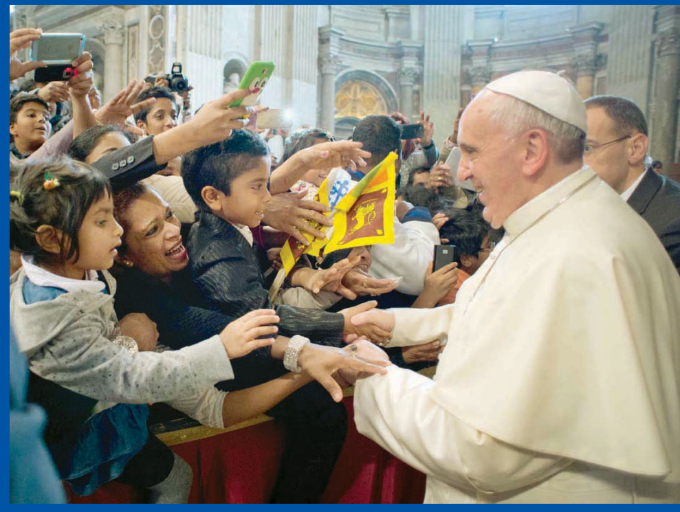
His Eminence Malcolm Cardinal Ranjith, early last year concerning a

The Papal Audience was an outcome of a suggestion made to His Holiness by the Archbishop of Colombo,