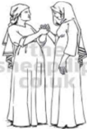
Blessed are you among women

"And when Elizabeth heard the greeting of Mary, the babe leaped in her womb; and Elizabeth was filled with the Holy Spirit and she exclaimed with a loud cry,