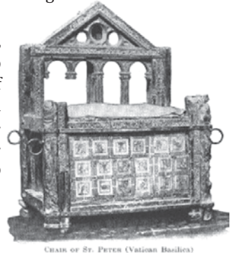
CHAIR OF ST. PETER (Vatican Basilica)

The See of Rome, after St Peter, thus came to be recognised as the See of the Successor of Peter, and its Bishop's " cathedra " represented the mission entrusted to him by Christ to tend his entire flock.