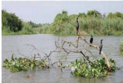
area in Sri Lanka, rich in bio diversity. This marshland was also named as one of the 41 internationally important wetlands in Sri Lanka by the Asian Wetland Inventory of 1989.

The land acquired for this proposed project is a part of the priceless wetland of the Mutturajawela marshland, which is the largest wetland