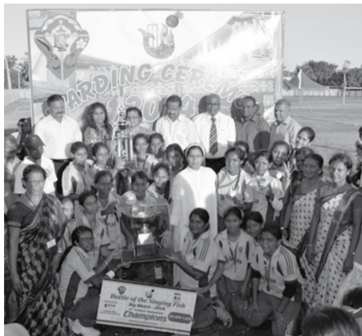
At the fifth Cricket Encounter held recently between two leading girls' schools in Batticaloa, St. Cecilia's Girls' College and Vincent Girls' High School at the Shivanandha Grounds which consisted of 20 overs, St. Cecilia's won the match by 5 wickets.