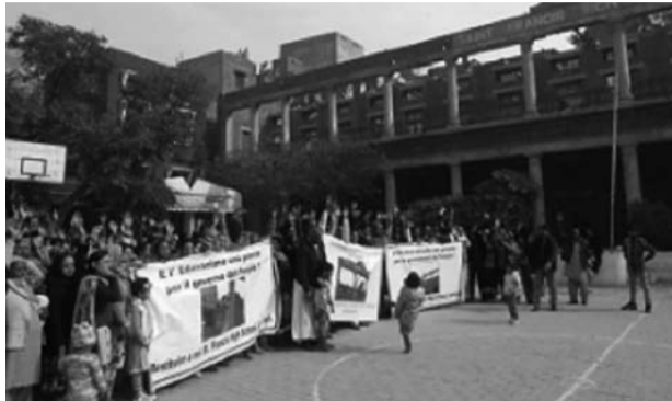
Activists successfully demand that St. Francis High School be returned to the Archdiocese of Lahore from the Pakistani government.

Bhutto's policy seized control of all schools, colleges, and hos-